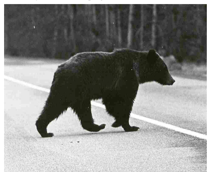
By feeding road-killed moose and elk to grizzlies when they first emerge from hibernation, Alberta biologists prevent them from attacking livestock until natural food is available.

when the bears first emerged from their dens. This necessitated trapping and transplanting one or more grizzlies every year, but fish and wildlife officers haven't had to transplant any problem grizzlies in the spring during the seven years since the program started.