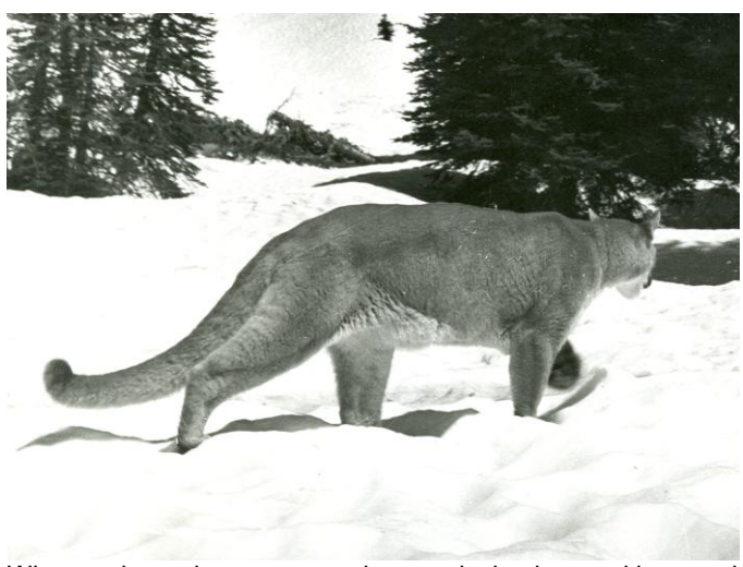
When prolonged extreme weather results in abnormal losses, the predators of game must be controlled to restore healthy balance.

Environmental activists who advocate locking up natural resources and letting nature take its course do not like being called "preservationists" or "protectionists" because these accurate terms have a negative connotation. They, and their allies in the media, falsely call themselves "conservationists", hiding their destructive agenda from the public by pretending they support resource conservation.