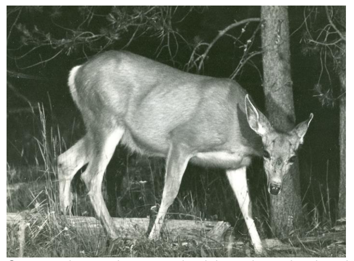
Game species must be managed to thrive and reproduce based on the habitat that is available during normal years.

In the first issue of the original Outdoorsman published in May 1969, I wrote, "We are dedicated to the wise use and perpetuation of our natural resources, including, first and foremost, our fish and game. We do not believe in the misguided concept that big game habitat must be unnaturally withdrawn from the very animals designed to inhabit it in the guise of conservation."